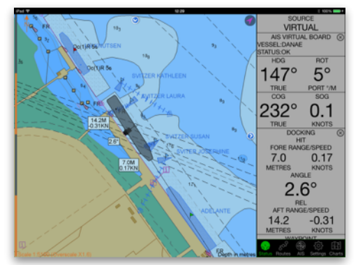
Docking on Humber River, UK