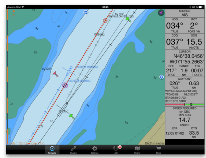
St Lawrence Seaway, Canada