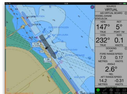
Docking on Humber River, UK