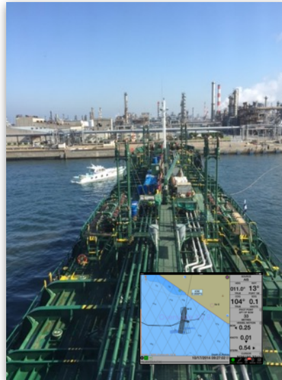
LNG Carrier in Japan