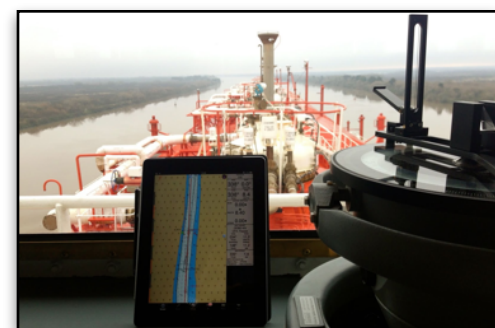
LNG Carrier on Paraná R, Argentina