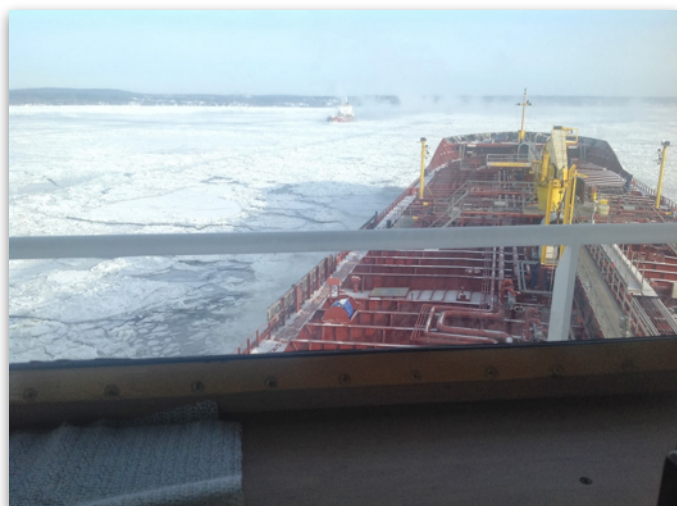
St Lawrence Seaway, Canada